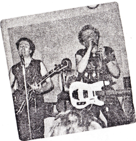
THE OUTCASTS FIRST GIG

I don't want to go on Top of The Pops and wear funny clothes!