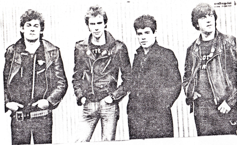
TOP RANK SUITE, PLYMOUTH, 23/7/80

From the little I saw of S.L.F. off stage I am convinced they are just merely ordinary people who are no different from the rest of us. I don't think they will ever become super stars and reject their fans.