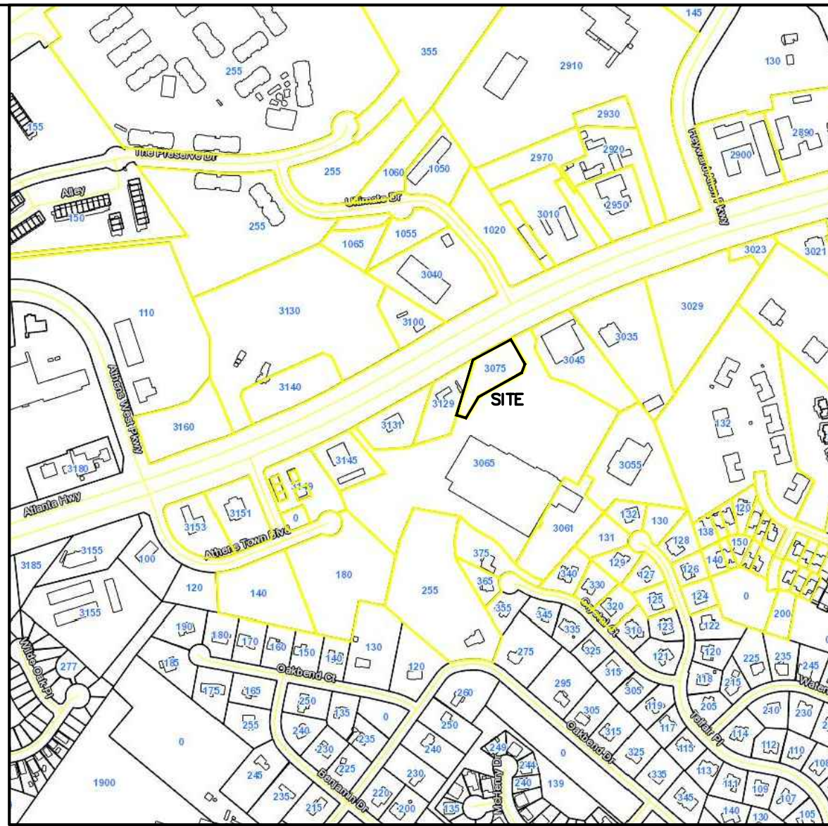
VICINITY MAP NTS

ATLANTA HIGHWAY (200' R/W, ASPHALT PAVED, PUBLIC, VARIABLE WIDTH) PB 37 - PG 16